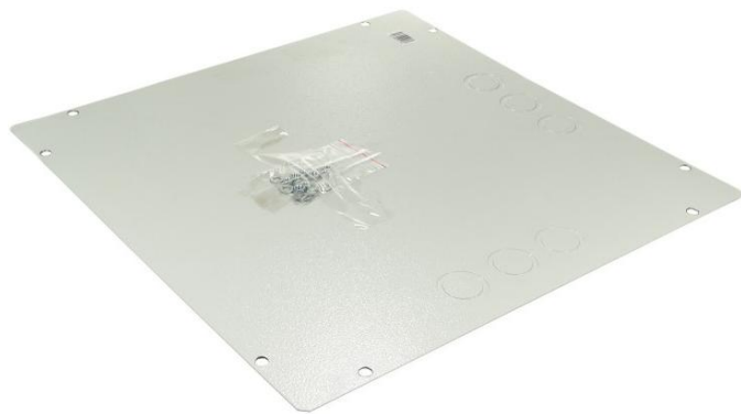
visualization of the floor plate